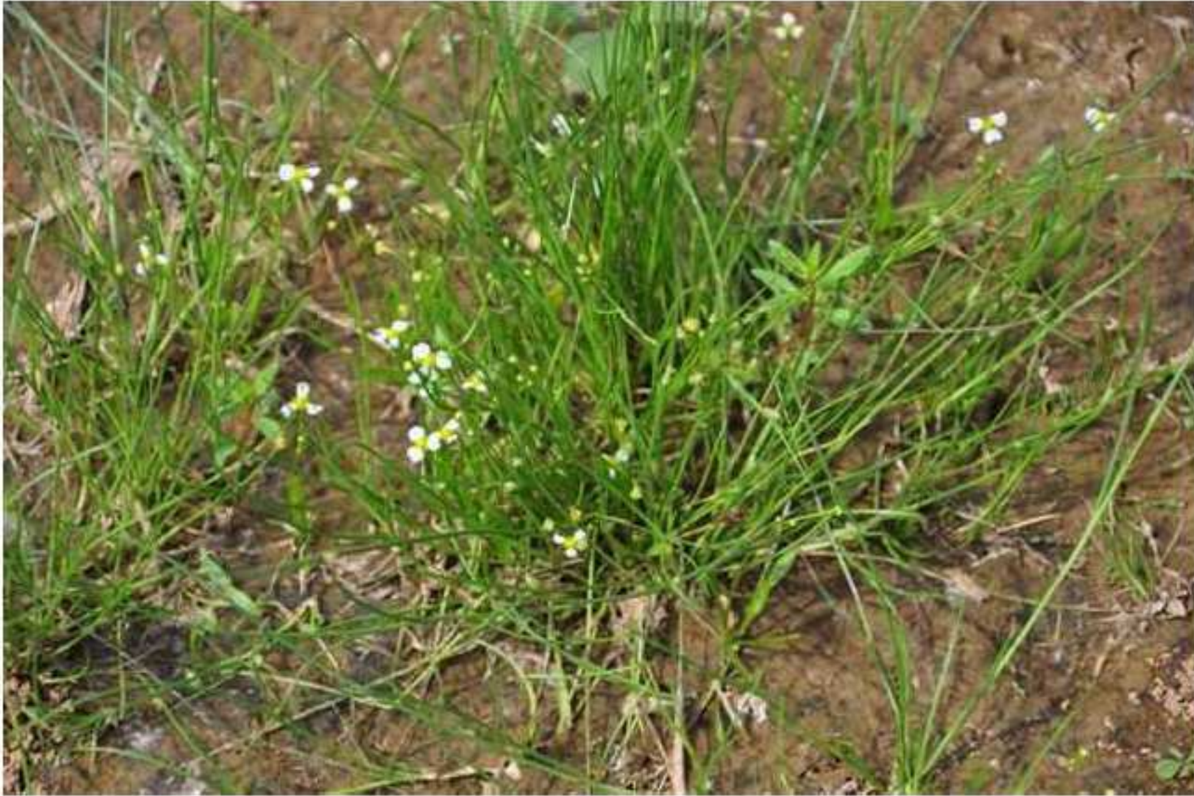
Figure 2. Echinodorus tenellus (flowering plants <8 cm in height) and Schoenoplectus hallii , Logan County, Kentucky.